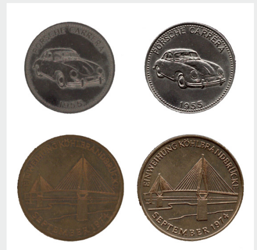
2D scan versus 3D scan, capture all details