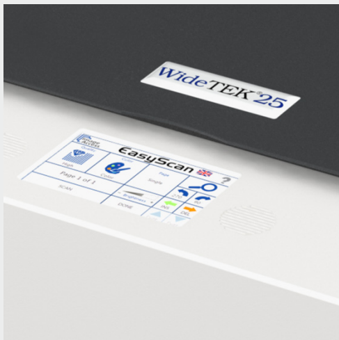
Large color touchscreen for simplified operation